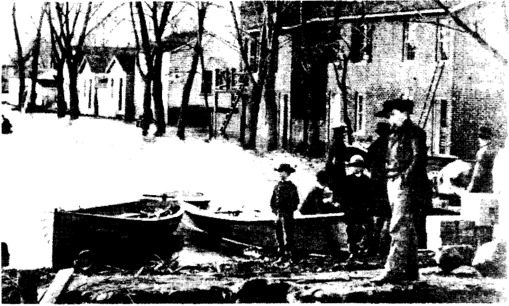
Sacramento during the flood — 5th Street south from L Street.