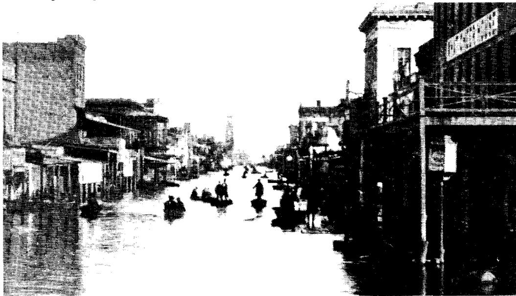
Looking out K Street from Sacramento River levee during flood of winter of 1861-1862.

The "Farmer's" prediction of next year's crops increasing was premature, for one of California's worst droughts set in. "It began in the fall of 1862 and lasted to the winter of 1864-1865." 73 Crops failed and cattle now died of starvation instead of drowning. The amount of rainfall in the valley for 1862 to 1864